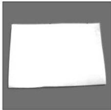
The size of the original paper

Rani took 4 papers of the same size and weight.