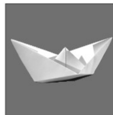
The entire paper was used to make a boat.