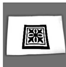
A label is stuck on the paper.