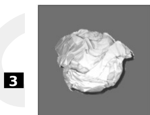
The paper was crumpled.